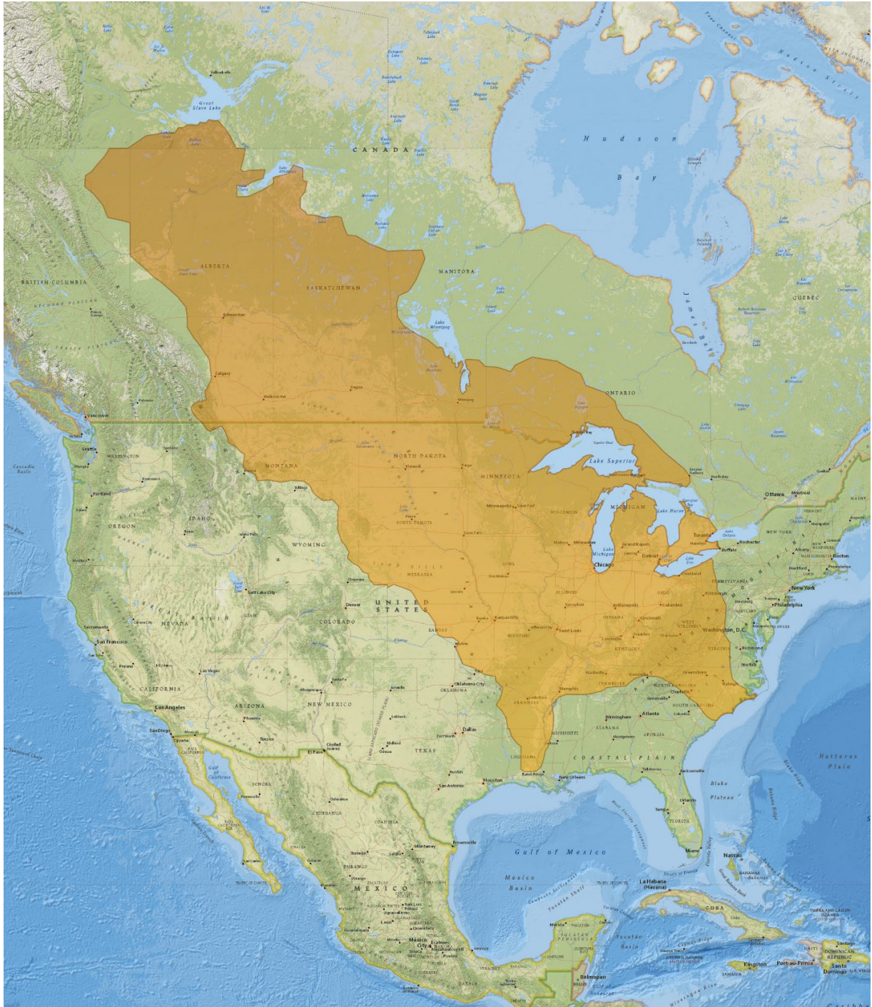
Figure 3. Map of North America, showing the extent of Ojibwe presence, linguistic base, intermarriage, and co-management of lands in yellow.